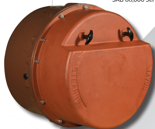
SAB 86,000 Series